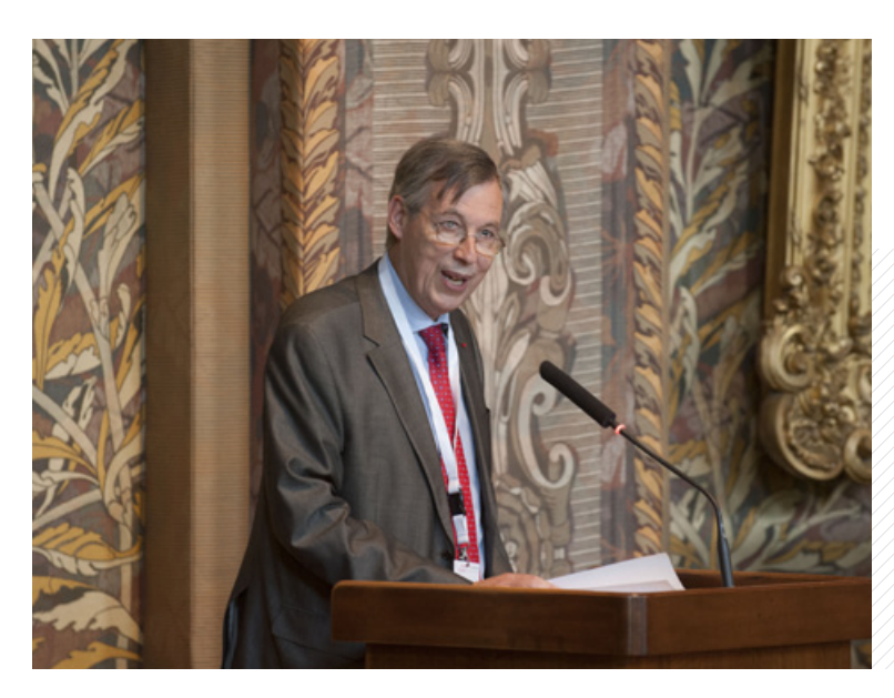
Mr Heisbourg diagnosing Europeans: 'We have great trouble growing up strategically'