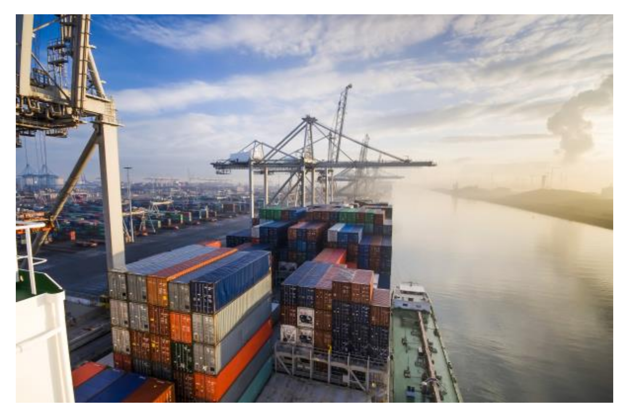
Ensuring the free movement of goods

Under EU law national authorities are responsible for checking that a car type meets all EU standards before individual cars can be sold on the Single Market. When a car manufacturer breaches the legal requirements, national authorities must take corrective action (such as ordering a recall) and must apply effective, dissuasive and proportionate penalties under national legislation. The Commission continued to monitor the enforcement of these rules by Member States in 2017.