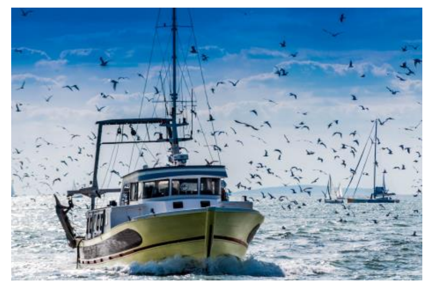
Enforcing the rules on maritime affairs and fisheries

To help Europe make the transition to a more 'circular' economy which uses natural resources more sustainably, fish resources must be managed in a sustainable way. This is also necessary to ensure jobs and growth in the fisheries sector in the long term. The Commission's enforcement strategy in 2017 therefore concentrated on the areas of fisheries conservation and control that are essential to building a circular economy.