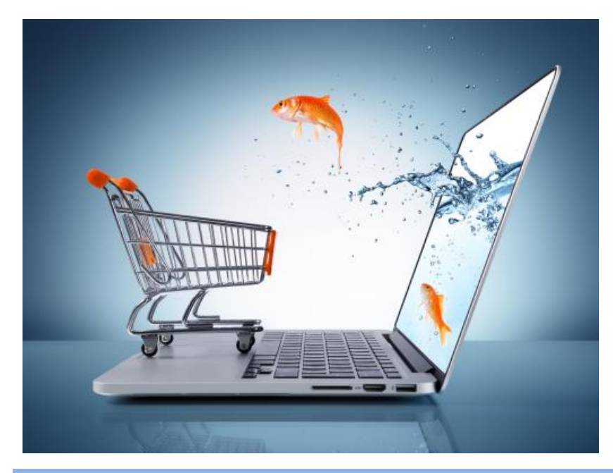
Guaranteeing trust in online transactions

The eSignature, which makes it possible to sign documents in the online world much like one signs a document with a pen in the offline world, is already a reality in the EU. However, <u>trust services</u> other than the eSignature are necessary to make electronic transactions in cross-border scenarios (as at national level) secure and legally valid.