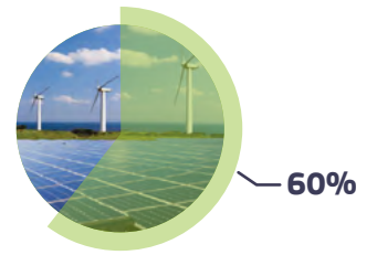
Bioenergy share in the renewable energy consumption*