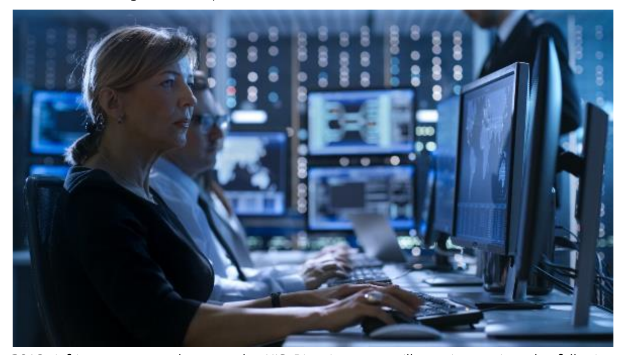
2019, infringement procedures on the NIS Directive were still ongoing against the following Member States: Belgium, Hungary, Austria, Romania and Slovenia.

In an increasingly digitised economy and society, cybersecurity threats are a growing concern. The <u>Directive on the Security of Network and Information Systems</u> (NIS Directive) improves the Union's overall level of cybersecurity. The Commission launched infringements against <u>6</u> Member States in 2019 for not having identified operators of essential services under that Directive. At the end of